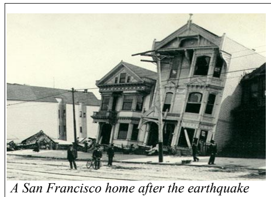
A San Francisco home after the earthquake