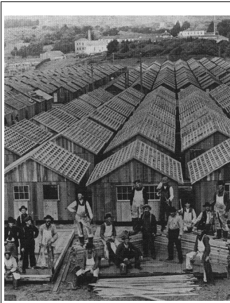
A 1906 refugee camp in SF

We now estimate that at least 3000 people were killed – maybe as many as 6000. Most of the deaths happened in San Francisco, but 189 were reported across the San Francisco Bay Area. Nearby places such as Santa Rosa, San Jose, and Stanford University were also severely damaged. At the time, the government only reported 478 deaths. They thought reporting the true number of deaths would make it harder to rebuild the city.