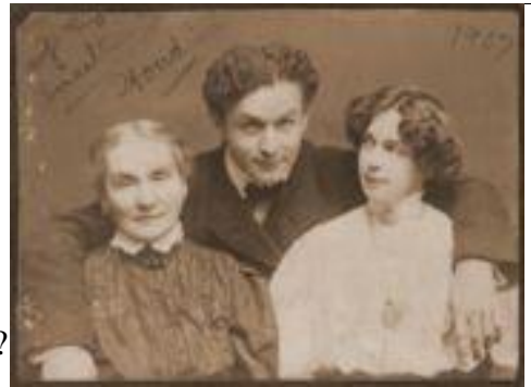
Houdini with his mother and wife

2. When did Houdini start working? What were his first jobs?