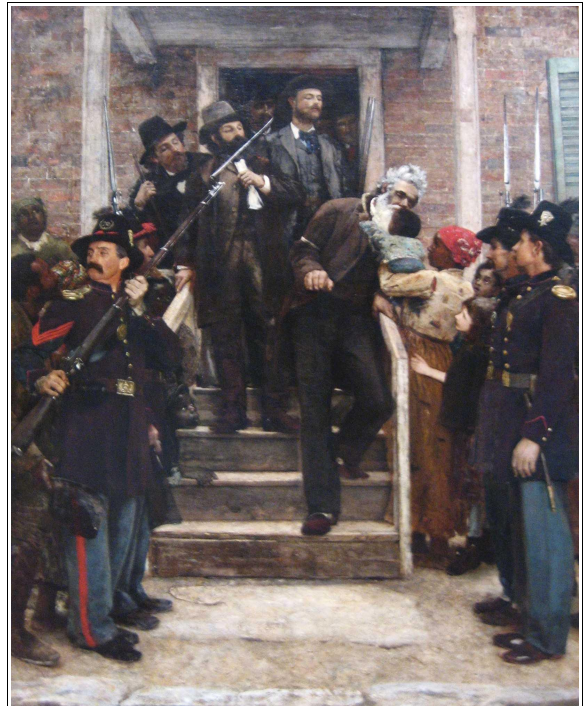
A painting of John Brown right before he was killed

2. Was it ok to John Brown to kill people? Is it ever ok to kill people?