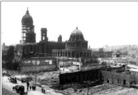
City Hall after the 1906 earthquake

In 1882, the US passed a law called the Chinese Exclusion Act. This law made it almost impossible for Chinese people to immigrate to the US, or become US citizens. After the earthquake, many Chinese men said they were born in America. This made them American citizens. This made their sons in China citizens, too. Their sons could then immigrate to the US.