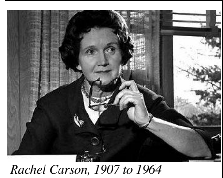
Rachel Carson, 1907 to 1964

Rachel Carson was born on a small farm in Pennsylvania in 1907. When she was young, she studied fields and forests for hours. She also wrote stories for a children's magazine.