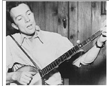
Pete Seeger made this song famous in 1970.

2. This song was first written in 1945. What problem did they want to overcome? (It’s not about the war.)