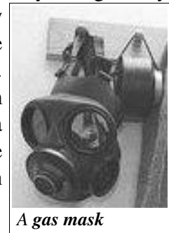
A gas mask

Germany attacked Russia and France. England and the US supported France. Every country thought they were going to win. Every country had new weapons. But it was the first European war in a long time, so no one knew the right way to use them. Thousands of soldiers ran into machine guns (see picture). Almost all of them were killed. Different countries also used poison gas. You had to put on a gas mask (see picture) very quickly or it would kill you. Thousands more soldiers were killed by poison gas. About 9 million soldiers and 6 million others were killed in World War I - over 15 million people altogether.