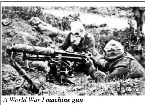
A World War I machine gun

When Russia sent soldiers to Serbia, it scared Germany. Germany was in the middle: Russia was on the east and France was on the west. They were both Germany's enemies. If they both attacked at the same time, Germany would lose. If Germany wanted to win, they had to quickly attack France and Russia first .